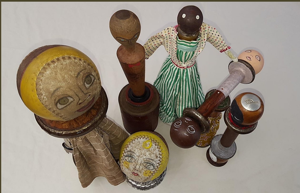
Kwei-lin Lum, A Delicate Balance , mixed media variable assemblage

Kwei-lin Lum was selected for Dab Art 's 2019 winter installment of its quarterly arts publication and online exhibition, GENESIS . This journal will visually explore the turbulent issue of immigration. The online exhibit will be archived March 31.