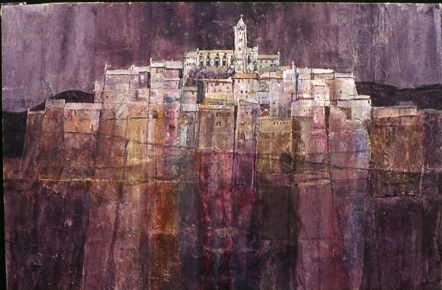
Small works similar to this piece are exhibited in the Gerald Brommer show. Most of the works are recent watercolor landscapes or pen and ink drawings.