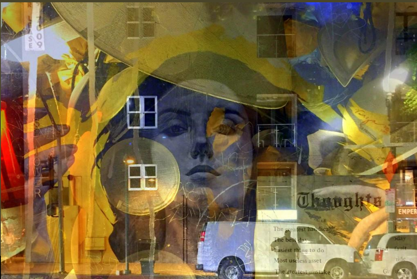
Susanne Belcher, Thoughts Become Things , digital photo collage