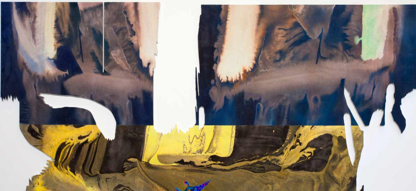
Tutela, 2015, 56"x 120", sand, canvas, ink, acrylic, aluminum

Her more recent paintings, while retaining the use of mixed media, have become more abstracted and focus on mineral textures and geologic features.